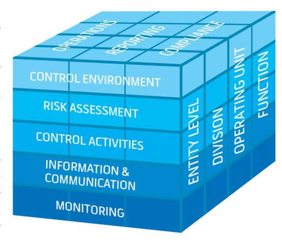
Figure 1: COSO Internal Control Framework

Grameenphone follows a risk-based approach for designing and implementing effective internal controls. Currently, the entire financial reporting of Grameenphone encompasses 18 inter-related processes. Risk assessment exercise is performed for each of the processes on an annual basis. As part of the risk assessment, each process is evaluated through probability and impact matrix and categorised into a four-point ordinal scale (Very High, High, Medium and Low). Internal controls are designed and deployed to mitigate identified risks to an acceptable level.