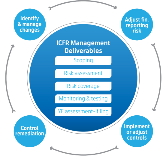
Fig: ICFR routines in Grameenphone

Controls are embedded in the processes by establishing ownership and through regular communication and training across the Organisation. Commitment at the top of the Organisation underpins a strong culture of internal control in GP.