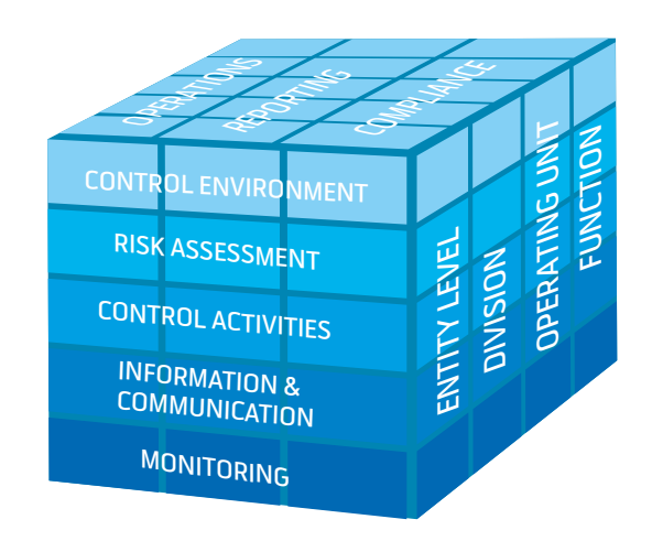
Figure 1: COSO Internal Control Framework

Grameenphone follows a risk-based approach for designing and implementing effective internal controls. Currently, the entire financial reporting of Grameenphone encompasses 19 inter-related processes. Risk assessment exercise is performed for each of the processes on annual basis. As part of the risk assessment, each process is evaluated through probability and impact matrix and categorized into a three-point ordinal scale (High, Medium, and Low). Internal controls are designed and deployed to mitigate identified risks to an acceptable level.